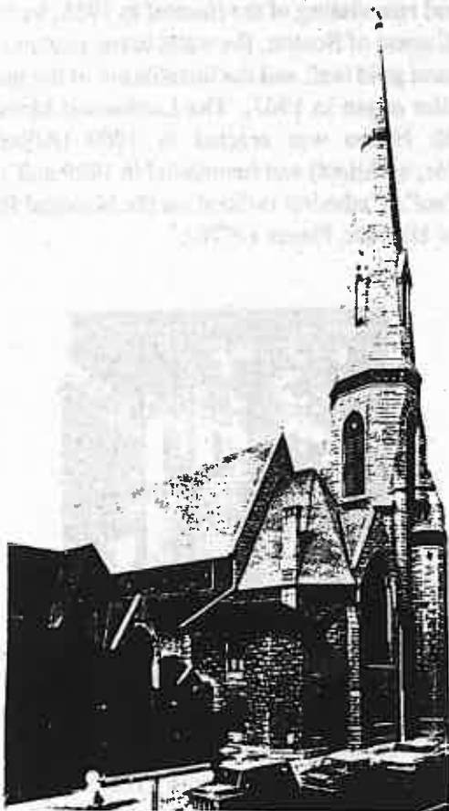
St. Paul's Third Church, 1884-Present